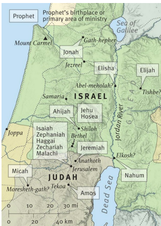
Prophets of Israel and Judah c. 875–430 B.C.