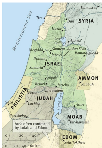
Israel and Judah in 2 Kings

1 Chronicles covers the same period of time as 2 Samuel and both describe the reign of David (See the Timeline above) whereas 2 Chronicles covers the same period of time as 1 Kings and 2 Kings and both describe the time from Solomon to the Babylonian Captivity. In Chronicles the kings of Israel (See table below where Jeroboam I identifies first of the kings of the 10 Northern tribes) are not mentioned unless they do something that relates to the kings of Judah. Note that the word "chronicle" means "a continuous and detailed account of historical events arranged in order of time." In First and Second Chronicles God has given us a very accurate history so that we can know all that He wants us to know about the period of the kings.