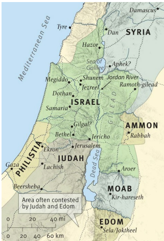
Israel and Judah in 2 Kings

1 Chronicles covers the same period of time as 2 Samuel and both describe the reign of David (See the Timeline above) whereas 2 Chronicles covers the same period of time as 1 Kings and 2 Kings and both describe the time from Solomon to the Babylonian Captivity. In Chronicles the kings of Israel (See table below where Jeroboam I identifies first of the kings of the 10 Northern tribes) are not mentioned unless they do something that relates to the kings of Judah. Note that the word "chronicle" means "a continuous and detailed account of historical events arranged in order of time." In First and Second Chronicles God has given us a very accurate history so that we can know all that He wants us to know about the period of the kings.